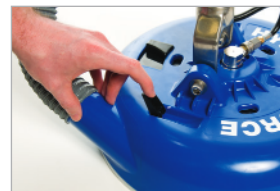
EZ-LOC™ boot (tool-less change)