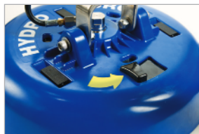
Quick change vacuum relief