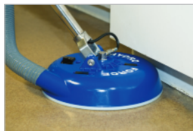
Low profile (fits under toe kicks)