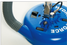
Radial vacuum line