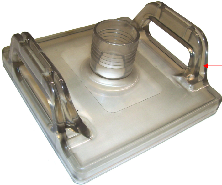
TOP PLATE - CLEAR FLASH SPOTTER NM5518