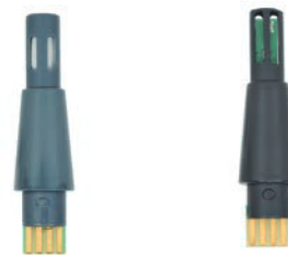
Hygrostick part number POL4750, for high moisture applications.