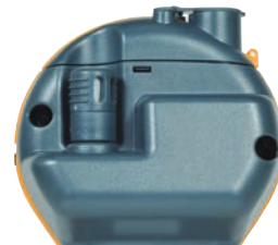
Quikstick ST POL78751, standard with all MMS3 kits and with the same performance as the standard Quikstick. A Quikstick ST can remain connected to the MMS3 while using the pins.

Readings from multiple Hygrosticks can be taken and recorded with ease. Humidity readings can be taken with the use of humidity sleeves or humidity box. Hygrosticks, not Humisticks, should be used for this test.