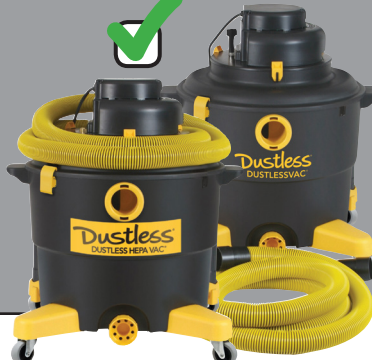
Wet+Dry DustlessVac® (Model D1603) + HEPA Wet+Dry DustlessVac® (Model D1606)* 260 CFM