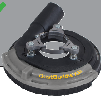
DustBuddie XP Dust Shroud (5" Model D5835)