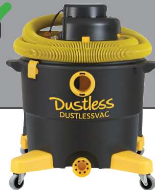
Wet+Dry DustlessVac® (Model D1603) 130 CFM

When grinding with a 7" - 9" angle grinder and a grinding wheel up to 7"