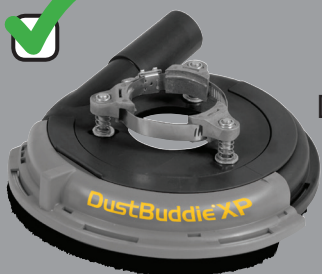
DustBuddie XP Dust Shroud (7" Model D5850)