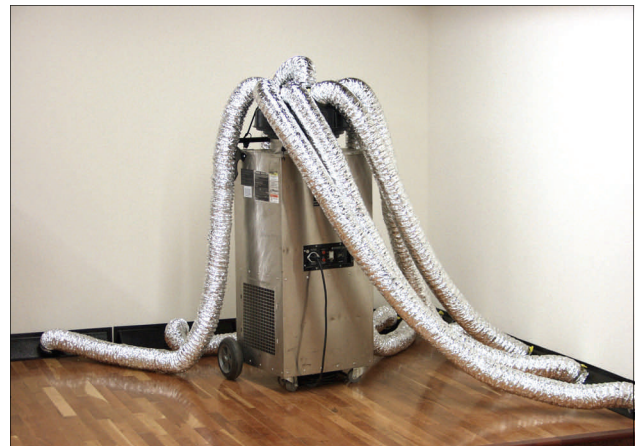
ADP-9 on Phoenix Guardian HEPA - drying negatively