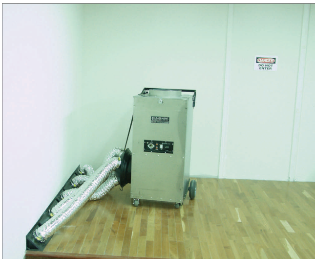
ADP-5 with Abatement Technologies PAS 1800 HEPA - drying positively