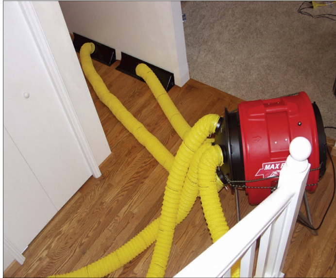
ADP-5 with Dry Air Technology's MAX Force

(New M4 ducting is silver Mylar - Photos shown with yellow discontinued DD4 ducting)