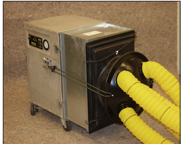
ADP-5 with Omni Force HEPA (shown with discontinued DD4)