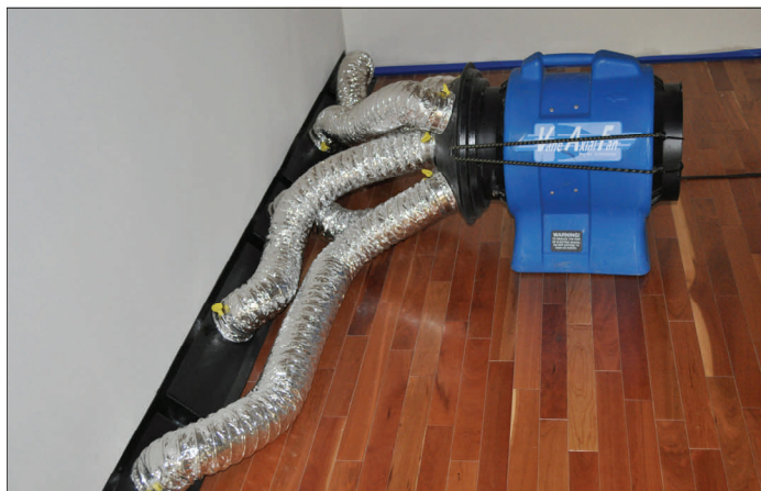
ADP-5 with Dry Air Technology's 12" Vane Axial Fan