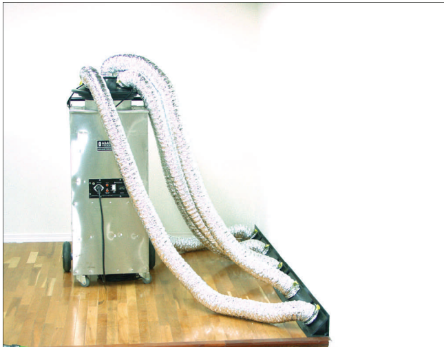
ADP-5 with Abatement Technologies PAS 1800 HEPA and new M4 ducting

Do not use negative suction on an outside wall if the grains of moisture outside are excessively high.